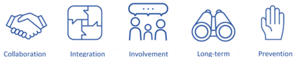
Figure 1: The 5 ways of working from the Well-being of Future Generations Act

Just as when we were preparing the Well-being Assessment, we have used the five ways of working, collaboration, integration, involvement, long term and prevention, to guide our work. This means that while considering how to improve well-being in our communities now, we've also looked at how well-being could be affected in the future and how we can prevent issues becoming worse. We will need to work together to see what we're each doing in a community and how this affects what we do, individually and in partnership. Finally, but most importantly, we want our communities, professionals, businesses and others to identify the issues which are most important to them.